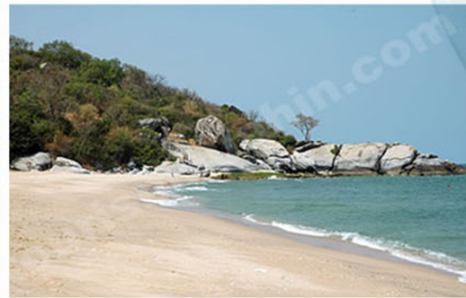
Sai Noi Beach