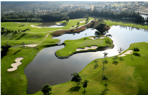
Banyan Golf Club