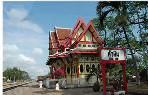
Hua-Hin Train Station