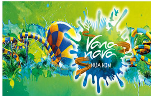
Vana Nava Water Park